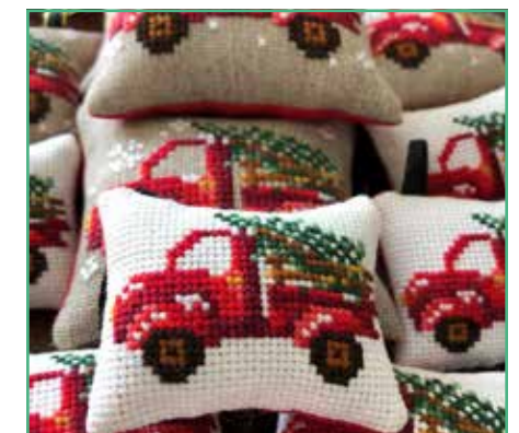
SEW EXQUISITE STAND D32

Arabella - full kit featuring Liberty fabric for sew along including binding, pattern and threads.