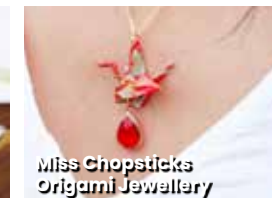
Miss Chopsticks Origami Jewellery