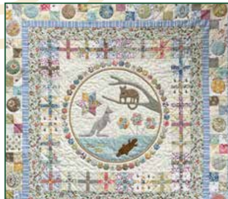
THE BIRDHOUSE STAND B01

Come see your favourite retailers and discover something new!