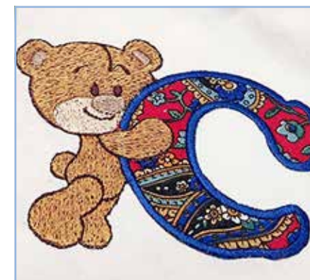
HATCH EMBROIDERY BY WILCOM STAND D24

Austrian-made crystals in Royal Blue Delite and Black Diamond, paired with German-made gold and rhodium-plated sew-on settings.