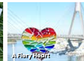
A Flery Heart