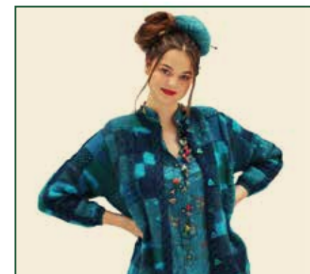
SIGNATUR HANDKNITS & KNITTING KITS STAND A25

Ultra compact folding scissors now in three convenient sizes small, medium and large.