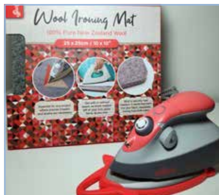
CEEBEE QUILTS STAND B15

Creativity at its best with the top-of-the-line B990 and the take anywhere new 3 Series machines on the BERNINA Stand D09.