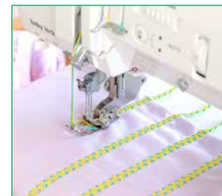
BABY LOCK AUSTRALIA STAND B24

The classic Blocks Cardigan handknitted in Australian wool and mohair, new colours and new yarns. Knitting kits available.