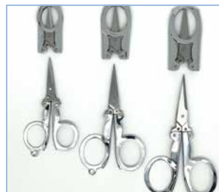
SCISSORMAN STAND A01

Come and see us for beautiful hand dyed silk ribbon and other embroidery supplies.