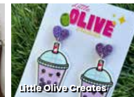
Little Olive Creates