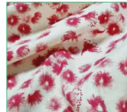
YOU ARE BRAVE TEXTILES STAND E23

This medium-sized tote features a secure zippered closure and a comfortable carry handle, making it ideal for taking your projects on the go.