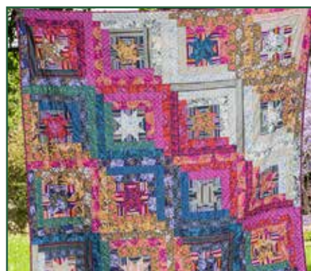
MATERIAL OBSESSION STAND A17

Mini Red Truck Christmas Ornaments on white 18ct Aida and Natural Linen.