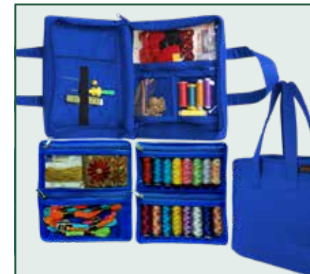
YAZZII STAND A13

The Ashford Electric E Spinner is portable, making spinning your own artisan yarn for your fibre creations, super easy and fun.