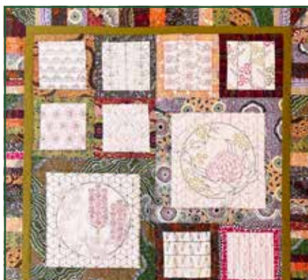
JUST PATCHWORK SEWEZI STAND A16

Upgrade your sewing space with the Oliso Mini Project Iron & Sew Easy Wool Ironing Mat (25cm sq) the perfect duo for precision quilting. Ask about their show special!