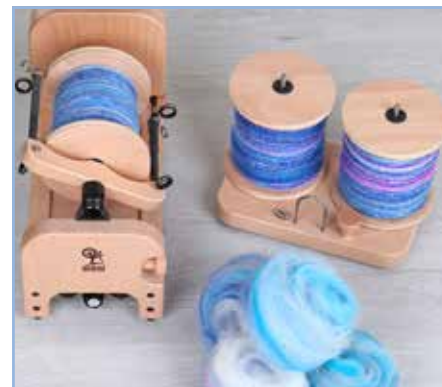
FIBRE ART IN AUSTRALIA STAND A12

Create a whimsical garden with the Tuscan Trellis Quilt. Applique this design to create a visually striking quilt.