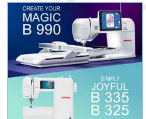
BERNINA STAND D09

Illustrative Natives hand screen printed collection - if you love Australian flora, you'll love this fabric range in fresh, new season colours on cotton poplin.