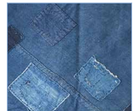
ZIGUZAGU JAPANESE VINTAGE TEXTILES STAND A28

New model Primo, the first Baby Lock Cover Stitch machine equipped with an exclusive Top Cover Stitch. A groundbreaking innovation.