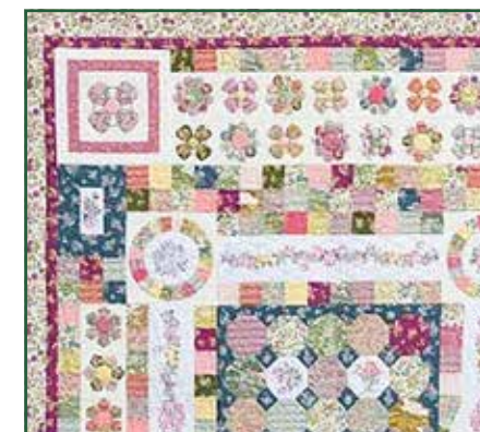
PICKLEMOUSE CORNER STAND A29

Add the new Keyboard Design Collections to your Hatch Embroidery Digitising software.