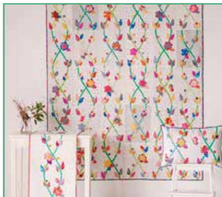
FABRICGARDEN.COM.AU STAND A09

A new quilt, celebrating our amazing Murray River. Features appliqué and EPP. Patterns and kits available at show.